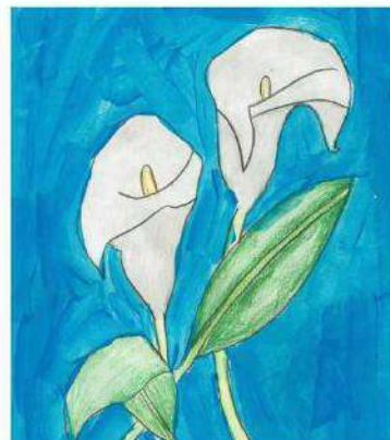
Inspired by 'The Walnut Tree'